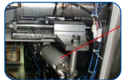
Pneumatic or Servo Horizontal Jaw Close