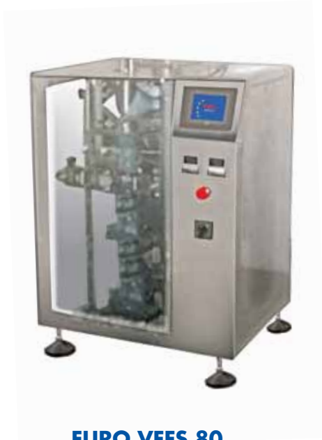
EURO VFFS 80

Entry level vertical form, fill and seal machine for small pillow packs