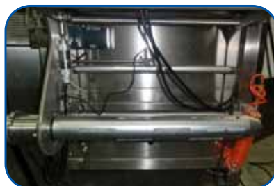
Reel Shaft with Air Expanders