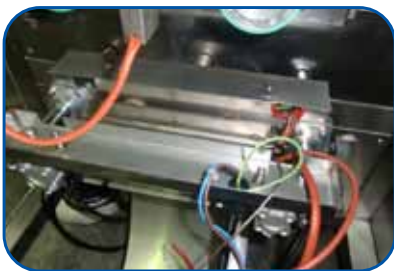
Easy Access to Horizontal Jaw Elements