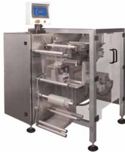
EURO VFFS 100

Entry level vertical form, fill and seal machine with reciprocating horizontal Jaw for increased speeds