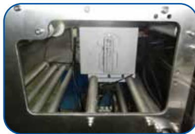
Thermal Transfer Printer